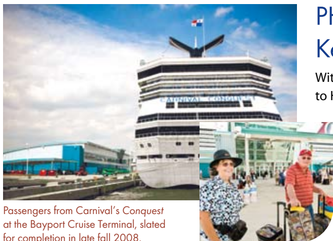
Passengers from Carnival's Conquest at the Bayport Cruise Terminal, slated for completion in late fall 2008.